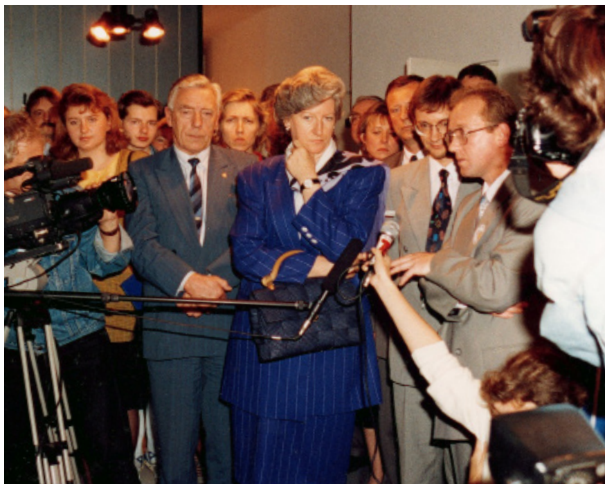
Opening of the „Cochlear Center.” In the ceremony participated the prime minister of Poland, Hanna Suchocka, minister Jerzy Koźmiński, secretary of state in the Ministry of Foreign Affairs, and Bohdan Jastrzębowski, voivode of Warsaw (1993)