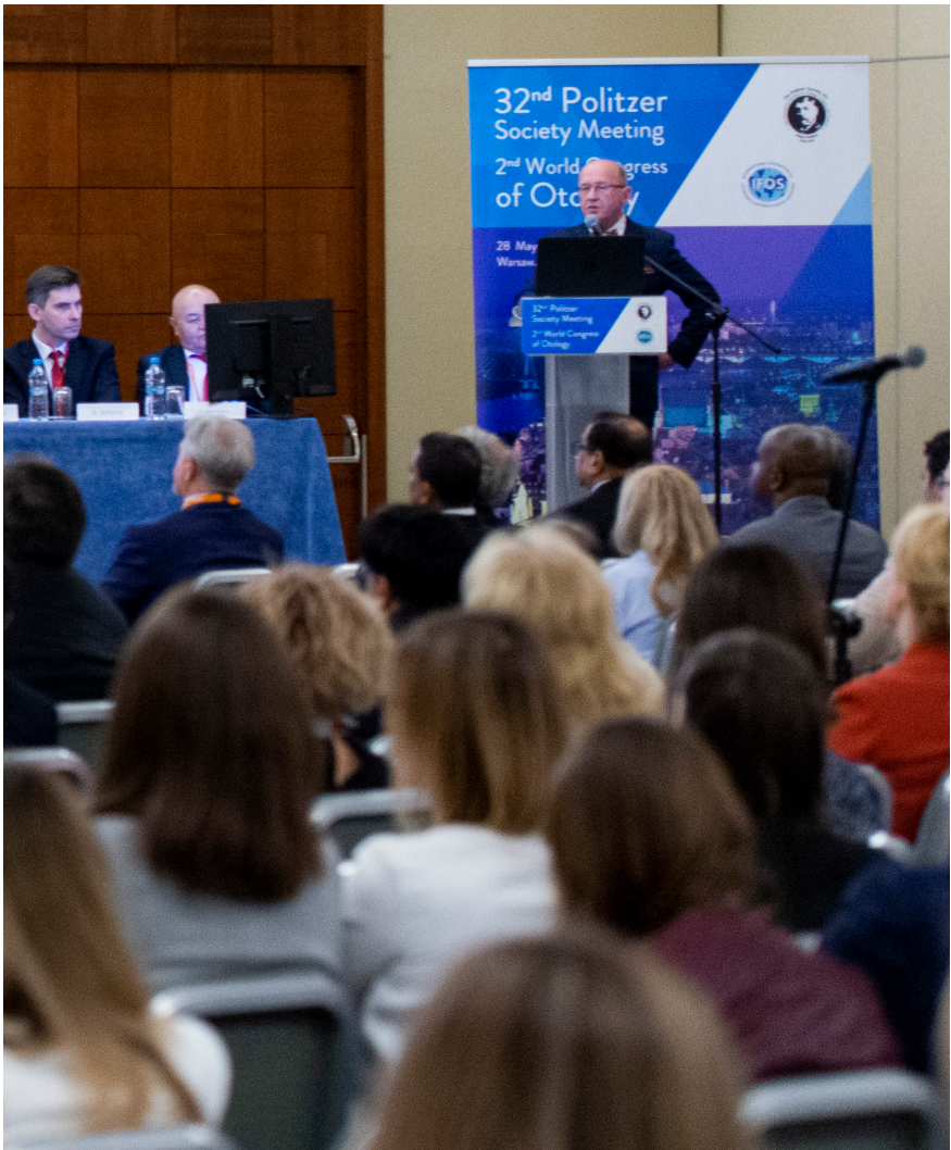
32nd Politzer Society Meeting, 2nd World Congress of Otolaryngology (2019)

Moreover, he was the organizer of 32 other international scientific conferences in Poland, 131 scientific training workshops, 11 international bilateral symposia (Polish-American, Polish-Belgian, Polish-British, Polish-Danish, Polish-French, Polish-German, Polish-Norwegian, Polish-Russian, Polish-Tajikistani, Polish-Ukrainian, Polish-Uzbek), 4 international conferences on telemedicine, 6 editions of the international Functional Endoscopic Sinus Surgery Course, 6 editions of the scientific conference "Guidelines in Otolaryngology, Audiology, and Phoniatics," 7 international conferences dedicated to music therapy and many others.